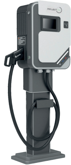
Optional Floor Stand (Not Included)